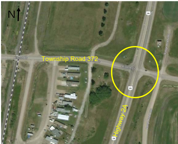
Figure 1. Intersection of Highway 2A and Township Road 372

The intersection at Highway 2A and Township Road 372 near the Hamlet of Springbrook (Figure 1) has experienced the pressures of this growth. Highway 2A is a provincial highway managed by Alberta Transportation. Township Road 372 is a local road managed by Red Deer County. Maintaining the safety and function of this intersection is a priority for both Alberta Transportation and Red Deer County.